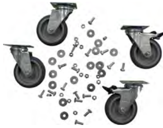
KIT103 Castor kit for storage boxes.

H x W x D ("): 14 x 6 ½ x 9 Weight (lbs): ½ Clip: N/A