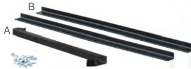
KIT36 Fixing kit for lockable storage box JBZ900.

H x W x D ("): 4 x 20 ½ x 1 (A) H x W x D ("): 1 ½ x 27 x 1 (B)