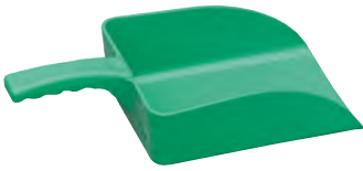
WIN-A607 ● Scoop shovel.

H x W x D ("): 14 x 6 ½ x 9 Weight (lbs): ½ Clip: N/A