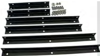
KIT55 For mounting SERIES 65 / 75 boxes to a vehicle at an angle of 30° or 60°.

H x W x D ("): 22 x 8 ½ x 6 Weight (lbs): 4 ½