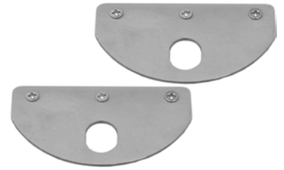
KIT104 Padlock kit for JBS110, JBS200 & JBS400R • Screws included • Padlock not supplied.