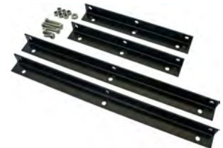
KIT65 For mounting SERIES 64 to a vehicle at an angle of 30° or 60°.