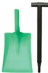
J-ADR-SF03 ● Two-part shovel.

KITALARM: A reed switch activated 95 dB self-contained 9 V alarm with three minute automatic reset upon activation. Alarm does not interfere with use of equipment.