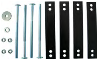
KIT80 For mounting SERIES 70 / 83 boxes to a landing leg • Suitable for 4 ¼ / 5 ¼ " wide landing legs.