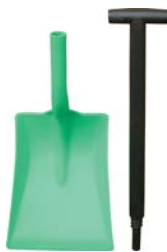
J-ADR-SF03 ● Two-part shovel.

KITALARM: A reed switch activated 95 dB self-contained 9 V alarm with three minute automatic reset upon activation. Alarm does not interfere with use of equipment.