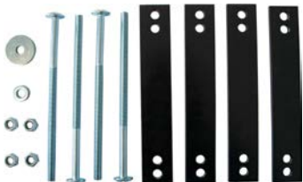
KIT80 For mounting SERIES 70 / 83 boxes to a landing leg • Suitable for 110 / 135 mm wide landing legs.