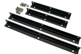
KIT65 For mounting SERIES 64 to a vehicle at an angle of 30° or 60°.