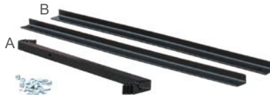
KIT36 Fixing kit for lockable storage box JBZ900.

H x W x D (mm): 100 x 520 x 25 (A) H x W x D (mm): 40 x 685 x 25 (B)