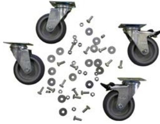
KIT103 Castor kit for storage boxes.

H x W x D (mm): 355 x 170 x 230 Weight (kg): 0.3 Clip: N/A