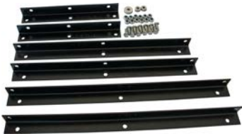
KIT55 For mounting SERIES 65 / 75 boxes to a vehicle at an angle of 30° or 60°.

H x W x D (mm): 560 x 220 x 150 Weight (kg): 2