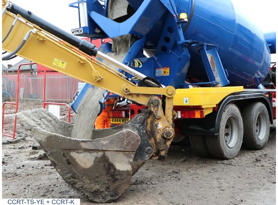
CCRT-TS-YE + CCRT-K