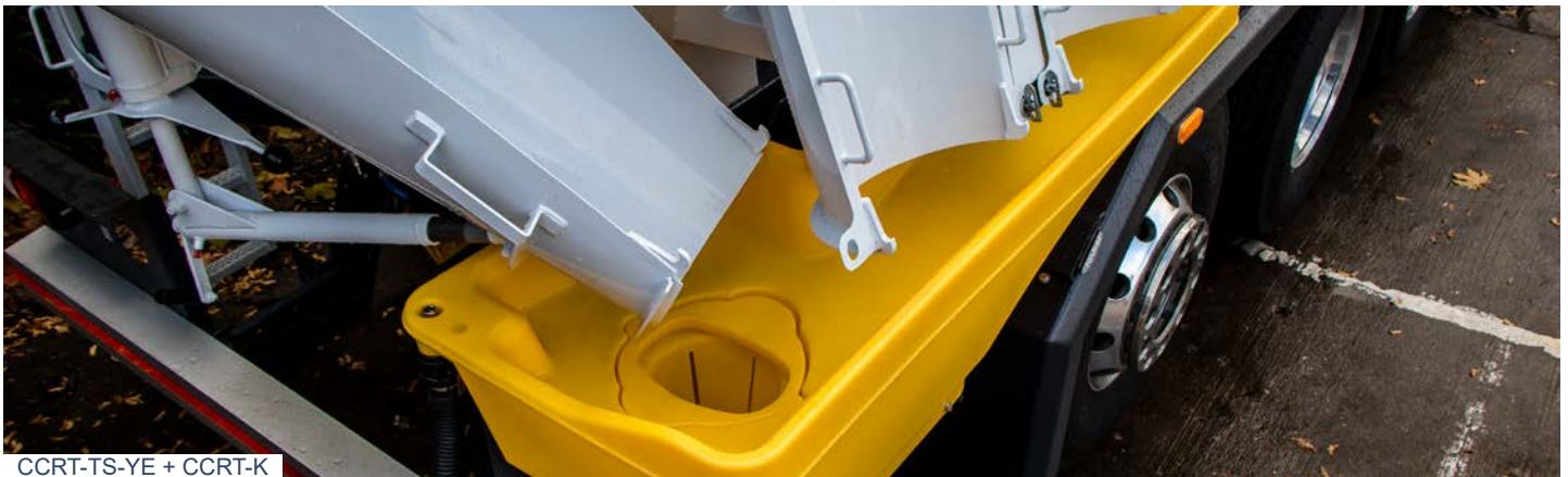
CCRT-TS-YE + CCRT-K