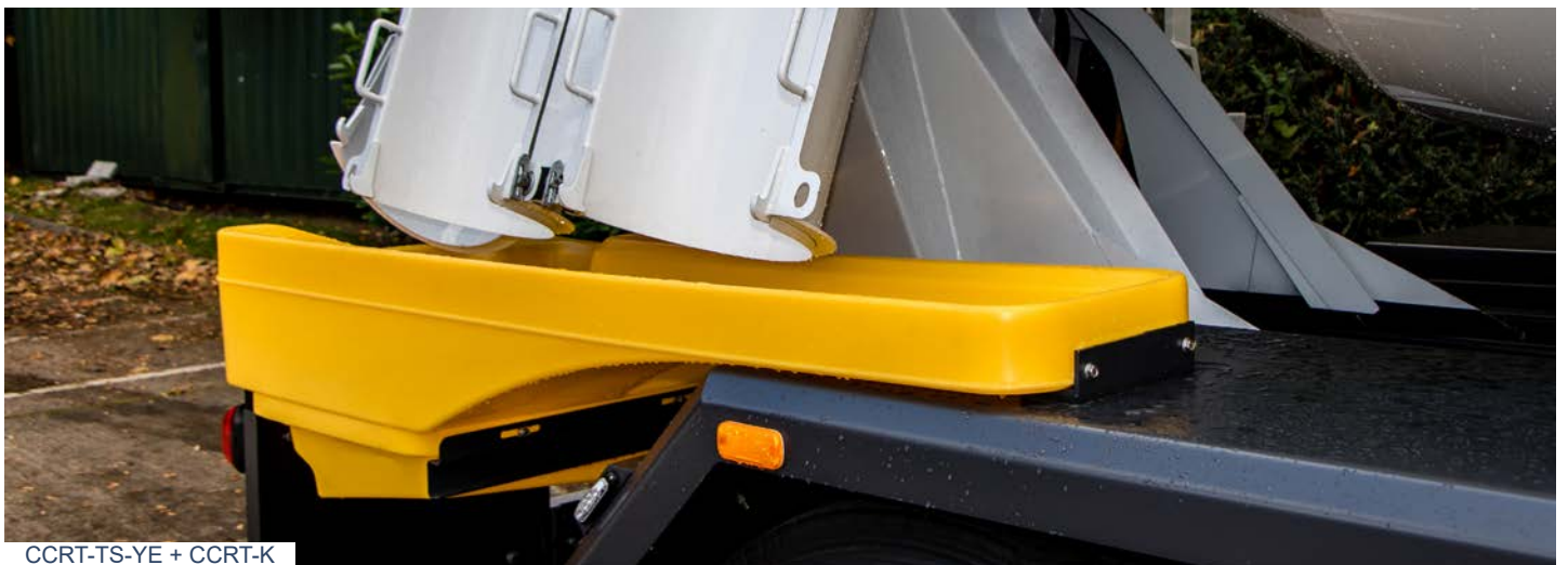
CCRT-TS-YE + CCRT-K