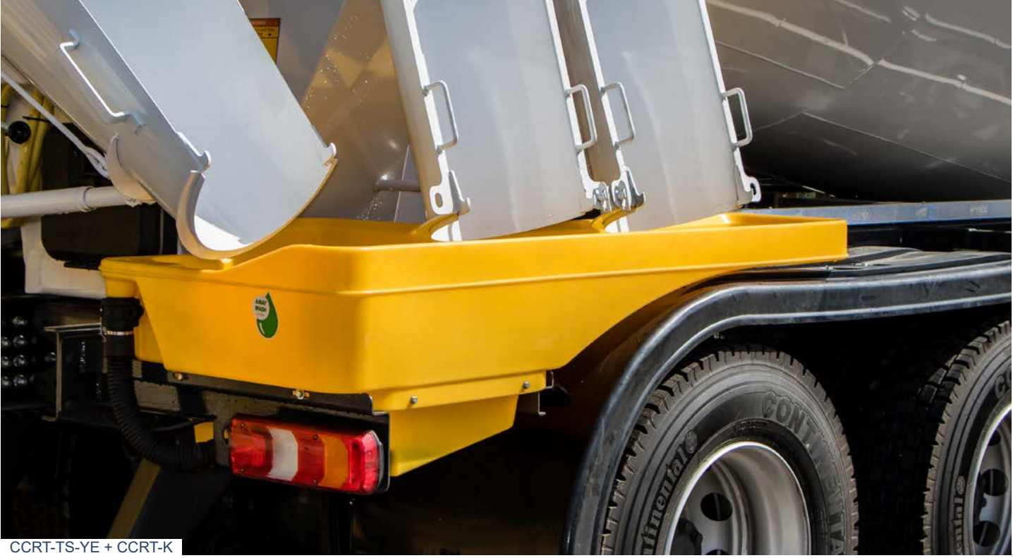
CCRT-TS-YE + CCRT-K

The unique design collects the washout waste and separates the coarse material in a robust sieve designed for easy emptying. At the batching plant, the containment tank is simply emptied through gravity by lowering the hose towards the settlement pits. There are no mechanical parts that could jam or require costly maintenance.