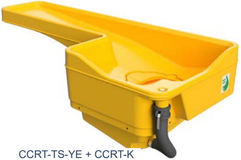
CCRT-TS-YE + CCRT-K